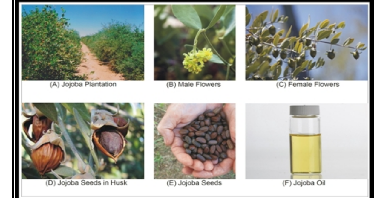
are less than half a centimetre in length. Leaves also have a waxy coating which helps in reduction of transpiration [9].