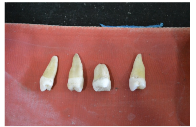
Fig. 1: Group A after incineration