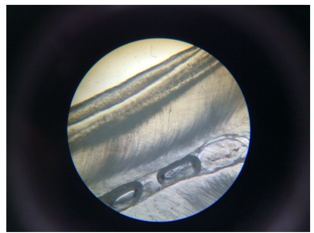
Fig. 4: Group D: uniform widening of dentinal tubules, wicker basket pattern of arrangement of tubules, inability to differentiate between enamel and dentin