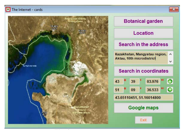
Fig. 4: Internet maps' working form

DInCeR also has an opportunity of program output of plants' geographical location on the interactive Yandex map on the Internet according to the predetermined coordinates in GPS or decimal degrees (Figure 4).