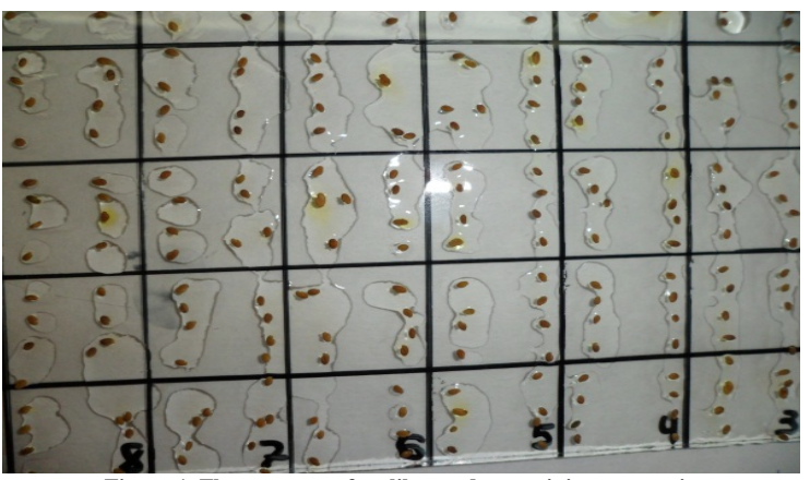
Figure 1. Fluorescence of melilot seeds containing coumarin