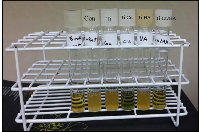
Figure 3: Turbidity evaluation for broth culture formed for Ti, Ti Cu, Ti HA and Ti Cu/HA