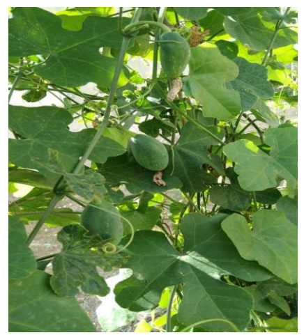
Fig- 1 Coccinia indica Botanical Name: Coccinia indica Family: Cucurbitaceae Synonyms: Tindora, Kowai fruit Vernacular names: Ivy gourd, Kundru, Tindora, Kovakka