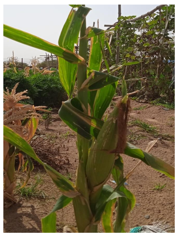
Fig-3 Zea mays

Botanical Name: Zea mays Family: Poaceae Synonyms: Corn, Maize,Indian corn Vernacular Names: Makai, Bhutta,Makka cholam,Mokka Jovanalu