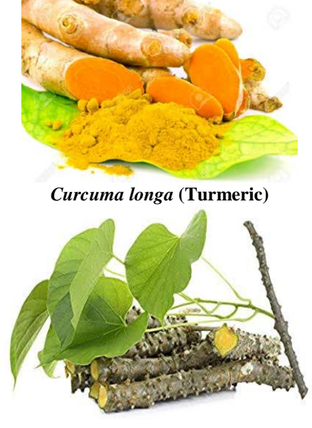
Tinospora cordifolia (Giloy)