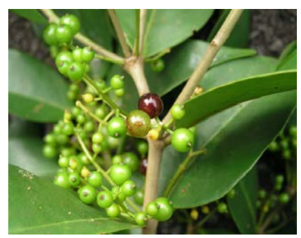
Macrosolen cochinchinensis (Starfruit Mistletoe)

The anticancer activity of combination of Sabrang onion (EP) and Starfruit mistletoe (MC) ethanolic extracts have been reported by the authors. Combined ethanolic extract of both plants induced apoptosis in HeLa cervical cancer cell. The cytotoxic potential of EP and MC combination was determined by MTT assay on HeLa cancer cells. The combination test was carried out with each of 16 concentration series below the concentration of IC50. Strongest synergistic effect (CI-0.15) showed by combination dose EP 22.62 µg/ml and MC 23.3 µg/ml as compared to other combination doses. Some other combination doses that have the synergistic effect was 23.3 µg/ml MC and 11.31 µg/ml EP; 23.3 µg/ml MC and 16.96 µg/ml EP. Both plant extract inhibited the cell cycle in G0-G1, G2/M and S (synthesis) phase when used in combination.[6]