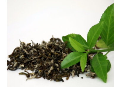
Camellia sinensis (Green tea leaves)

Green tea contains polyphenol Epigallocatechin-3-Ogallate (EGCG), has a variety of physiological and pharmacological effects.