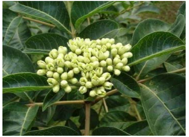
Evodia rutaecarpa (d-Limonene)

Berberine is a component of Coptidis rhizome and d-Limonene is a component of Evodia rutaecarpa . The combined extracts exhibited antitumor effects on rat subjects.