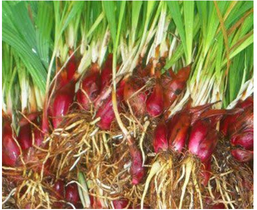
Eleutherine palmifolia (Dayak onion)

7) Eleutherine palmifolia and Macrosolen cochinchinensis in cervical cancer