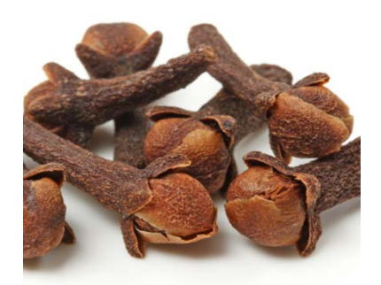
Syzygium aromaticum (Clove)