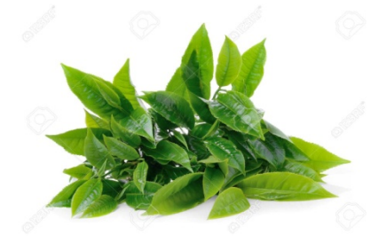
Camellia sinensis (Green tea leaves)

In China, people drink jujube tea ( Z. jujuba and green tea) for their better health. The chloroform extract of Z. jujuba showed anticancer activity on HepG2 liver cancer cells. When green tea extract used in combination with chloroform extract of Z. jujube , tea extract increased the cyotoxic activity of jujube extract in HepG2 cancer cells and inhibited the growth of cancer cells on G1 phase but did not show effect on apoptosis. It increased p53 and p21 proteins. When p21 increased then it binds with Cdk21 and inhibited its binding to cyclin E, which result in G1 phase arrest. According to authors G1 phase also restricted when the level of cyclin E decreased, resulting decrease in cyclin E-cdk2 complex.[5]