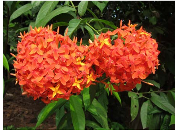
Picture 1: Ixora coccinea Linn (Family: Rubiaceae; Malayalam-Thetti)

Ixora coccinea (or jungle geranium, flame of the woods, and jungle flame) is a species of flowering plant in the Rubiaceae family, a small to medium sized hardy shrub and is cultivated for ornamental purpose and also it finds place in traditional Indian medicine. It is a common flowering shrub native to Southern India and Sri Lanka. It has become one of the most popular flowering shrubs in South Florida gardens and landscapes. Its name derives from an Indian deity. I. coccinea is a dense, multibranched evergreen shrub, commonly 4-6 ft (1.2-2 m) in height, but capable of reaching up to 12 ft (3.6 m) high. It has a rounded form, with a spread that may exceed its height. The glossy, leathery, oblong leaves are about 4 in (10 cm) long, with entire margins, and are carried in opposite pairs or whorled on the stems. Small tubular, scarlet flowers in dense rounded clusters 2-5 in (5-13 cm) across are produced almost all year long.