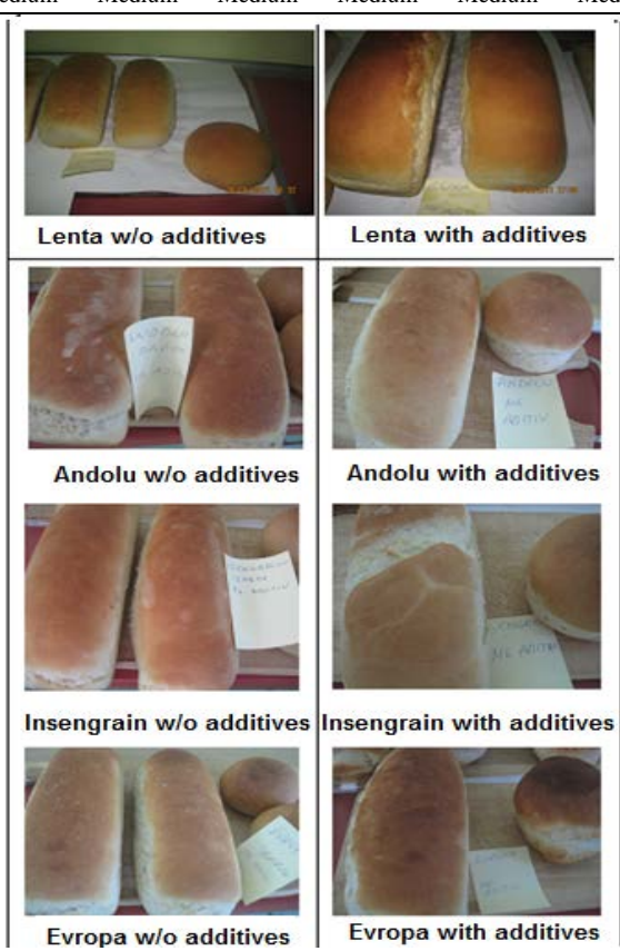
Photo 1. The depiction of the bread produced from Type-500 with and without additives