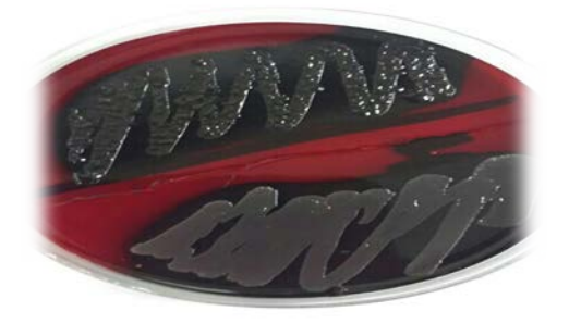
Fig.(3):- Isolates producing biofilm on congo red agar