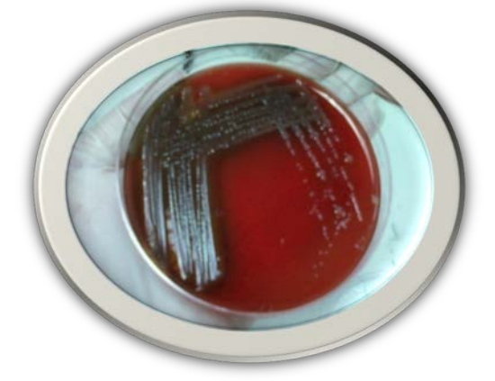
Fig.(1):- Isolates producing Hemolysis production on blood agar

One of the reasons for the chang in the molecular stracture that affect the composition of nucleic acid and leads to the elimination of plasmids is the association of ethidium bromide with DNA, is responsible for loss of the phenotypic characteristic [24],this indicates that antimicrobial resistant genes were plasmid located and this result in agreement with loss of resistance determinants (plasmids) that was investigated as previously reported [25,26].