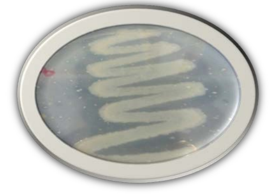
Fig.(2):- Isolates producing protease on Skim milk agar