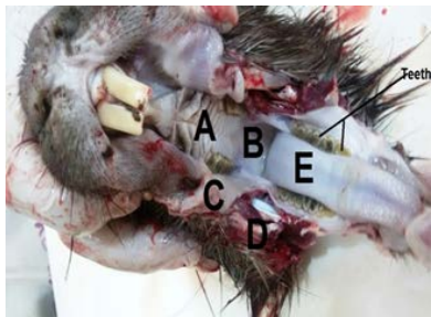
Fig 3. Macrogragh showing the: A-hard palate, B-soft palate Ccheek D-gum E-tongue.