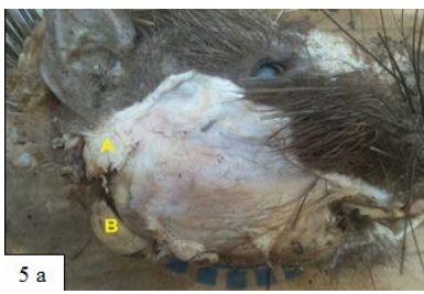
Fig 5 a. Macrogragh showing the salivary gland A- parotid, Bmandibular.