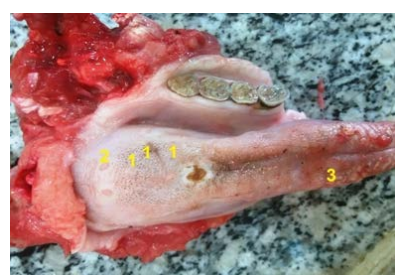
Fig 9. Macrograph showing the Tongue papillae 1-fungiform 2circumvallet 3-filiform.