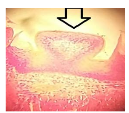
Fig 10 b. Histological section showing the Circumvallet papillae (H& E 400x).