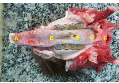
Fig 6. Macrogragh showing the Tongue A-apex, B-body, C- root, D- torus lingue, E- epiglottis.