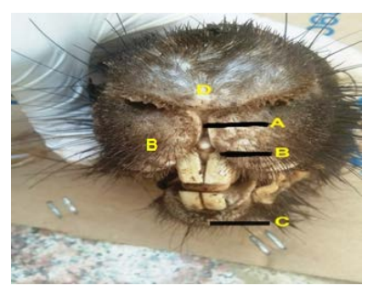
Fig1. Macrogragh showing the: A-fissure of upper lip, B-upper lips ,C-lower lip ,D –nose.