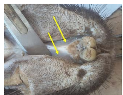
Fig 2. Macrogragh showing the extent of the cheek pouch.