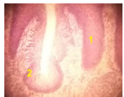
Fig 7a. Histological section showing the Tongue 1,2 keratinized stratified squamous epithelium (H&E 100x).