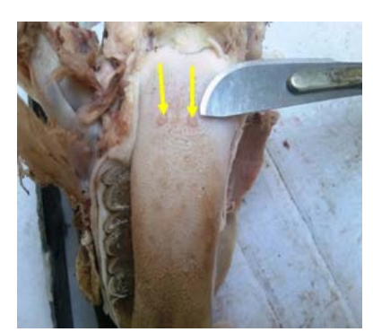
Fig 10 a. Macrogragh showing the Circumvallet papillae