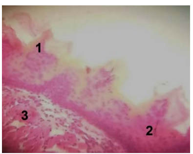
Fig 8. Histological section showing the Tongue 1- fileform papillae 2- keratinized stratified squamous epithelium 3- skeletal muscle (H&E 100x).